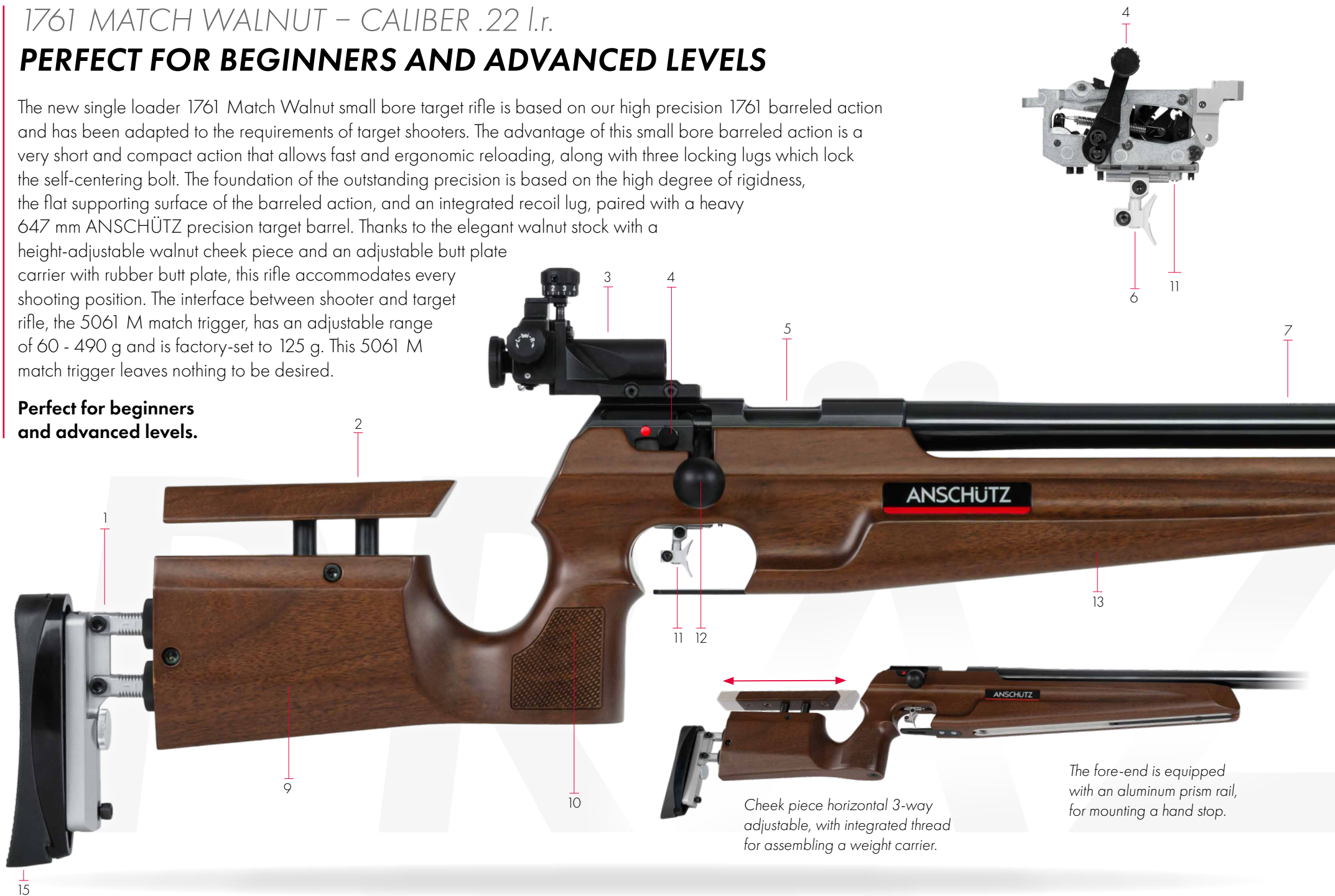
Cheek piece horizontal 3-way adjustable, with integrated thread for assembling a weight carrier.

Perfect for beginners and advanced levels.